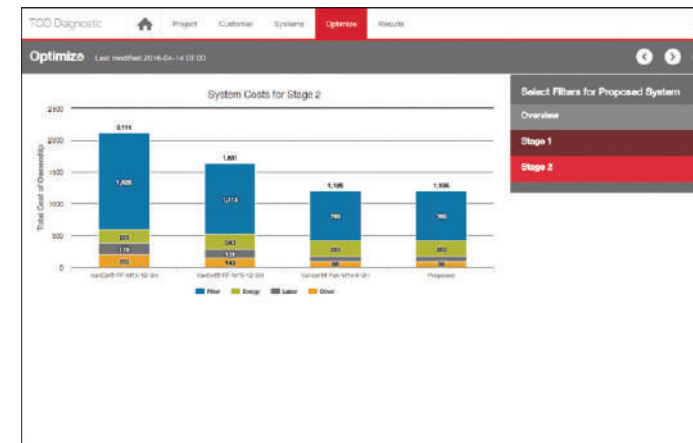
This depicts filter cost optimization relative to annual costs for filters, energy, labor, and other total cost of ownership for the Current System, two Optimized Options, and the Proposed System.