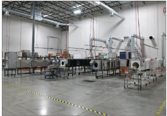
AAF Flanders operates its Clean Air Innovation & Research Center (Clean AIR Center) near its World Headquarters in Louisville, Kentucky.

Only AAF Flanders has a long history with deep, technical knowledge and archives to bring the experience, expertise, and reliable data to the customer. Our mission is to help you protect your environment, reduce your business risk, and optimize your clean air related spending. We will always strive to invest our time and expertise to help you improve your business, not just to sell you a product.