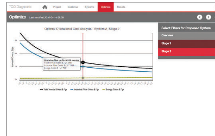
Service Cycle Optimizer allows the user to adjust the service cycle and see the values for total cost, energy cost, and filter cost change.